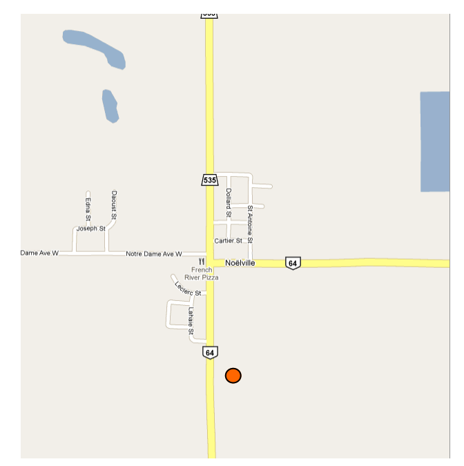
Public Works Yard - 142 St. David St South