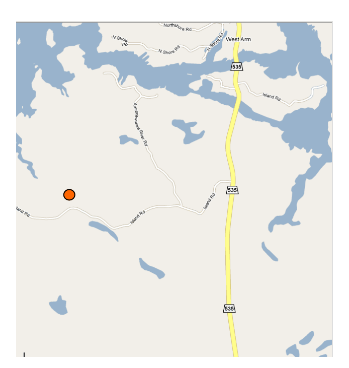
Shaw Road Site - 1 km off Hwy 535